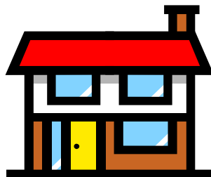
Childhood lead poisoning remains a major environmental health problem in the U.S.